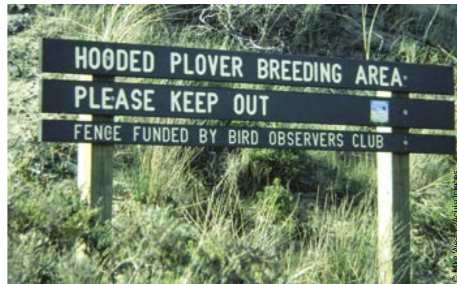
Hooded plover protected area sign on the adjacent Bellarine Peninsula