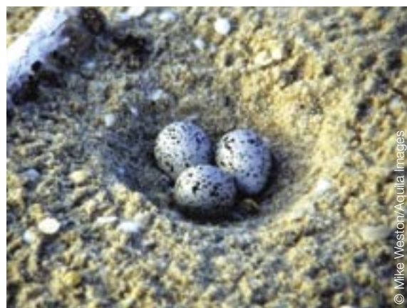
Hooded plover nest.

Natural events, such as storm tides and predation by native species can also have negative impacts. On their own, these events would not be normally expected to have an enormous impact, however when they are coupled with the above threats and the fact that the existing population is so small, such impacts can be significant.